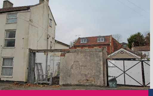
Guide Price: £65,000-£75,000

Land adj. 5 Church Hill, Brislington, Bristol BS4 4LT