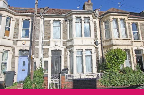
Guide Price: £200,000+

30 Westminster Road, Whitehall, Bristol BS5 9AW