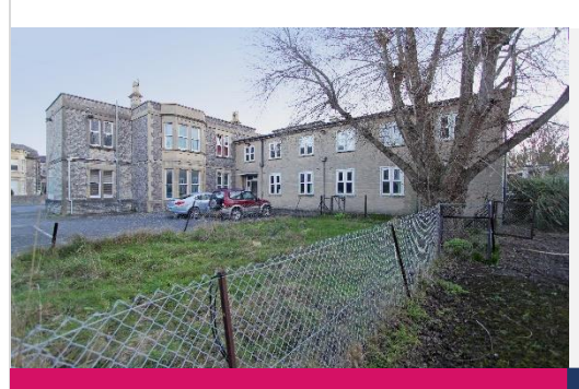
SOLD FOR £145,000

12 Clifton Road, Weston Super Mare, Bristol BS23 1BL